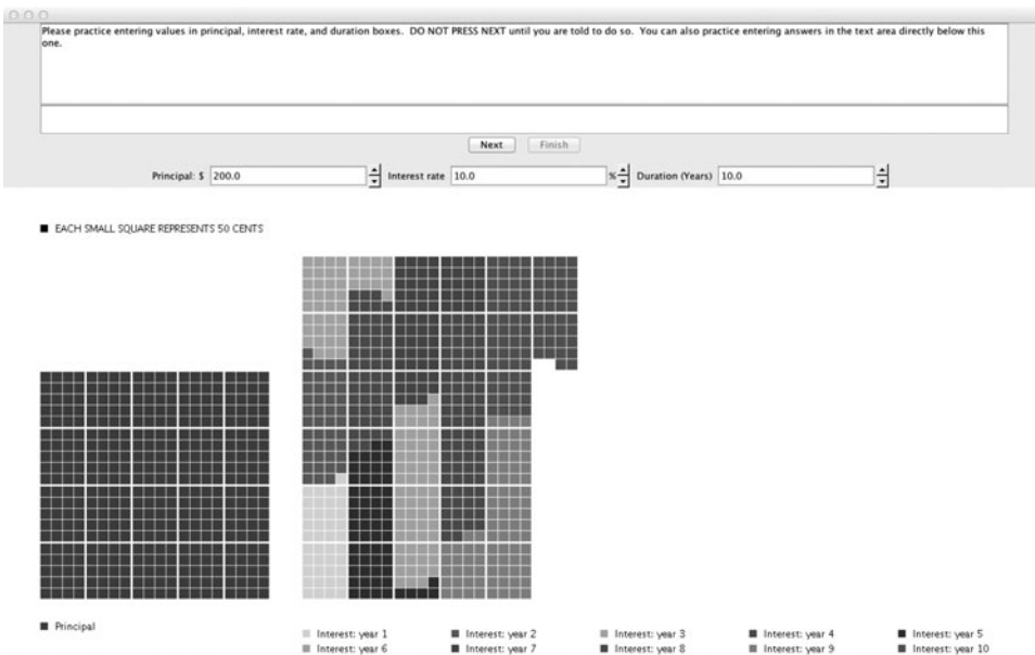
Figure 3. Volumetric tool screenshot.

changes. Like the linear tool, the volumetric tool also could show general patterns without requiring users to perform symbolic operations on actual dollar amounts. However, the volumetric tool lacked the linear tool's ability to show the nature of long-term trends (i.e., linear, concave upward).